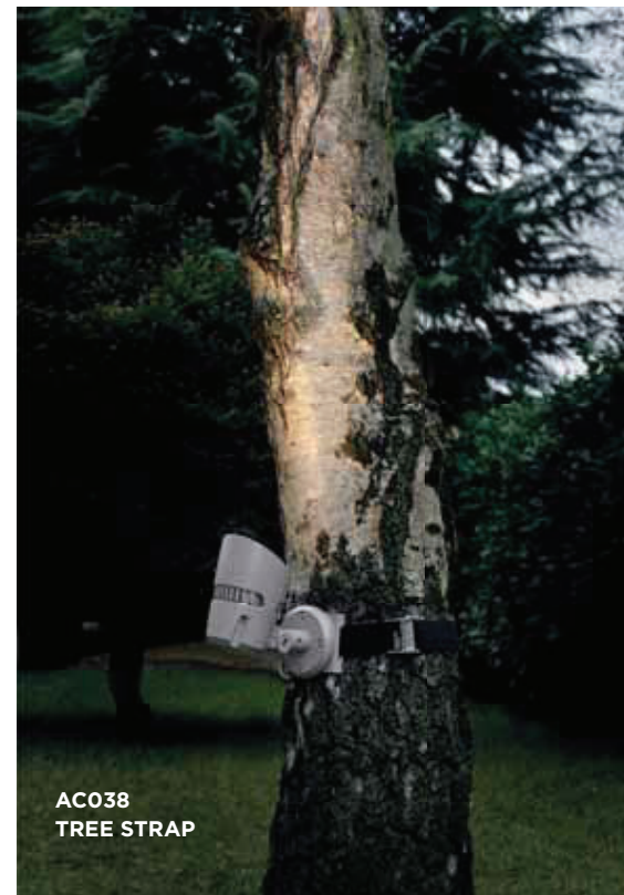
AC038 TREE STRAP